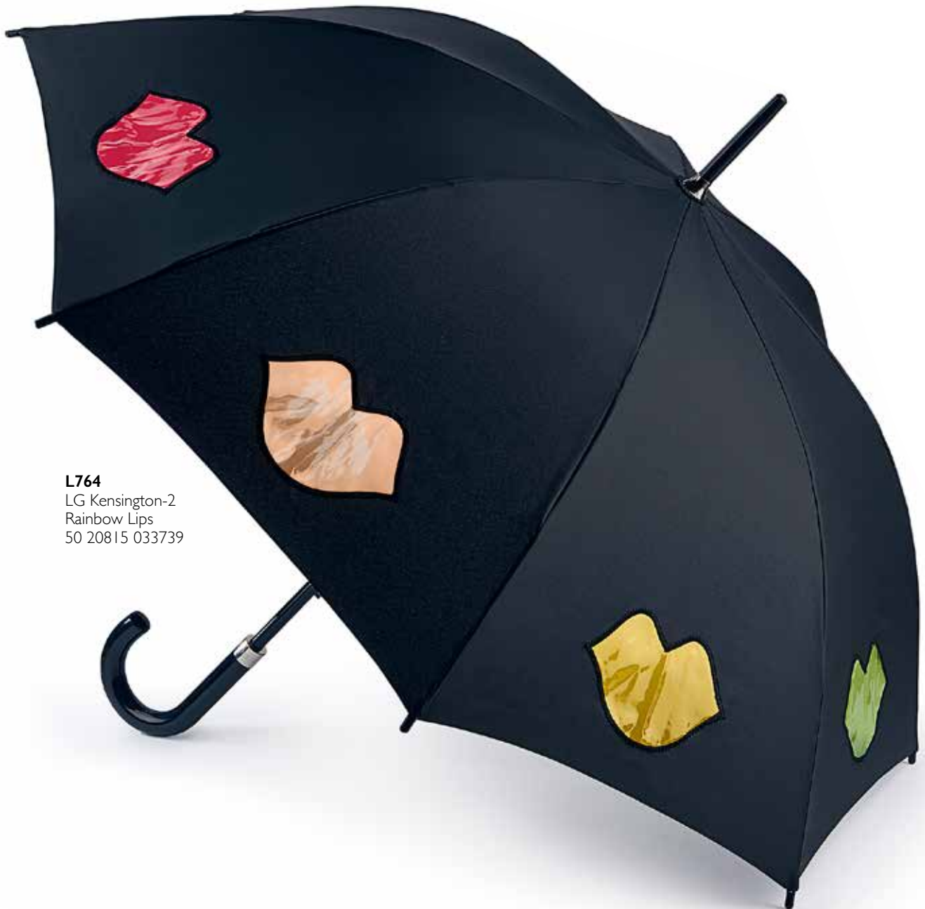
L764 LG Kensington-2 Rainbow Lips 50 20815 033739