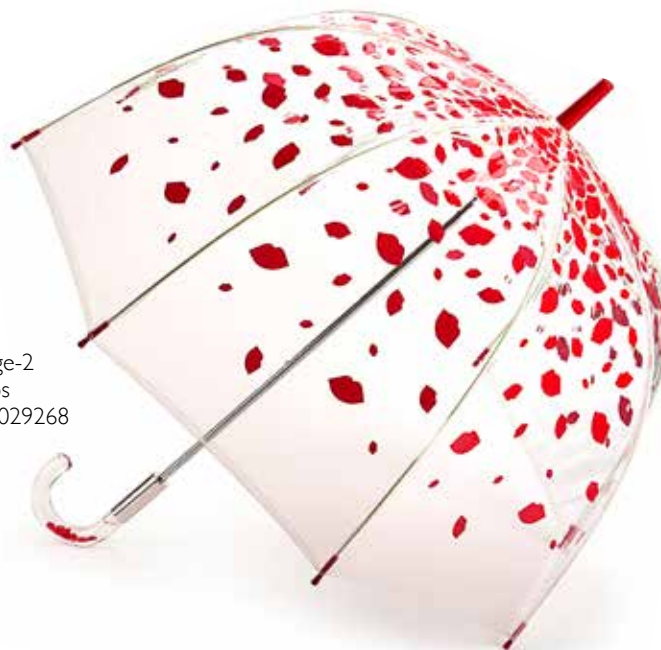
L719 LG Birdcage-2 Raining Lips 50 20815 029268