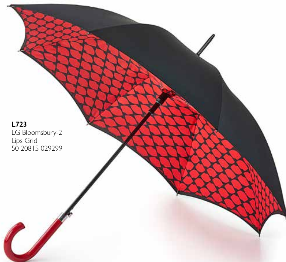
L723 LG Bloomsbury-2 Lips Grid 50 20815 029299