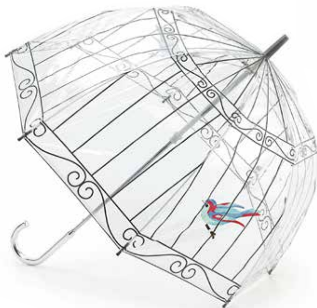
L719 LG Birdcage-2 Birdcage Birdcage 50 20815 017036