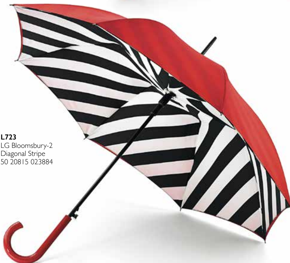
L723 LG Bloomsbury-2 Diagonal Stripe 50 20815 023884