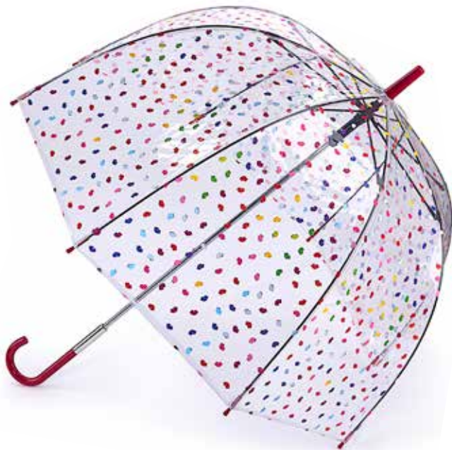
L719 LG Birdcage-2 Confetti Lip Birdcage 50 20815 033746