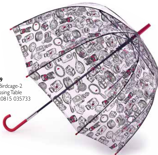
L719 LG Birdcage-2 Dressing Table 50 20815 035733